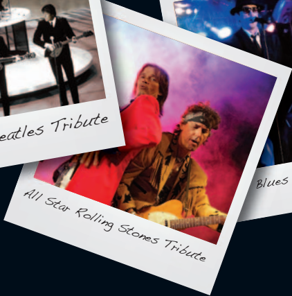
All Star Rolling Stones Tribute