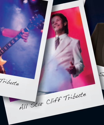
All Star Cliff Tribute