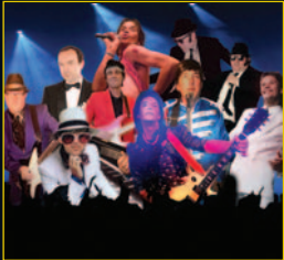
All Star Supergroup Approx 50 mins show

A band made up of Superstars! On stage together we present tributes to Paul McCartney, Mick Jagger, Mark Knopfler, Elvis Costello and Ringo Starr - all at the same time , producing a unique 'All Star' live band (add in costume changes to Elton John, David Bowie, Cliff Richard or others if you like), each star performing a their all-time classic hits.