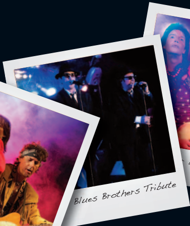
Blues Brothers Tribute