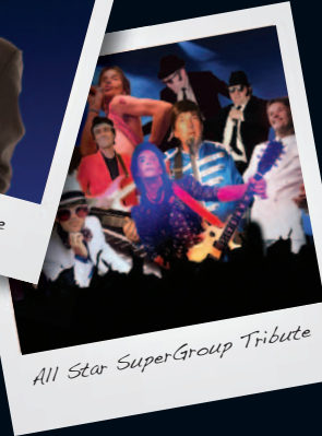
All Star SuperGroup Tribute

The World's Most Versatile Tribute Band!