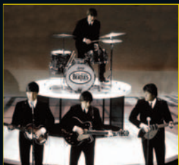
All Star Beatles Tribute Approx 50 mins show

The All Star Beatles Tribute brings together many years of experience with numerous Beatles tribute acts to create a Beatles experience like no other. They superbly reproduce in precise detail the evolving sights and sounds of the greatest band in history from the early days of mop top hair and matching suits, to the astonishing psychedelic horizons of 'Sgt Pepper' and beyond.