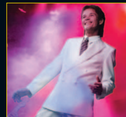
All Stars Cliff Richard Tribute Approx 45 mins show

Six decades of foot-tapping rock 'n roll and pop hits from this tribute to Cliff Richard and the Shadows. Includes a wonderful acoustic singalong medley of favourites.