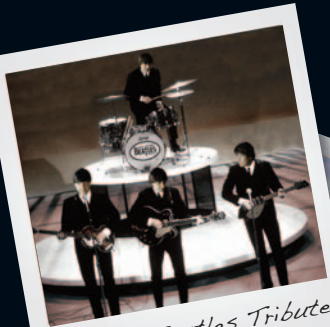
All Star Beatles Tribute