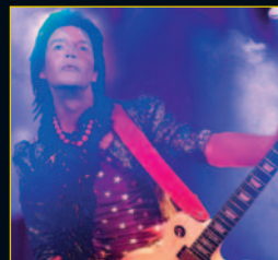
All Stars David Bowie Tribute Approx 50 mins show

A 'rock theatre' spectacle, with Bowie songs from 60's, 70's, & 80's. From Ziggy Stardust and Space Oddity to dance classics China Girl, Let's Dance and Modern Love, this glamorous show appeals to a wide range of audiences.