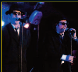
All Stars Blues Brothers Tribute Approx 50 mins show

'It's 106 miles to chicago, we gotta full tank of gas, half a pack of cigarettes, it's dark, and we're wearing sunglasses' . Shake your Tail Feather to Jake & Ellwood Blues, backed by live musicians with their all singing all dancing Blues Brothers spectacular. 'Everybody Needs Somebody', 'Gimme Some Lovin', 'Mustang Sally', 'Soul Man' ... classic dance floor fillers.